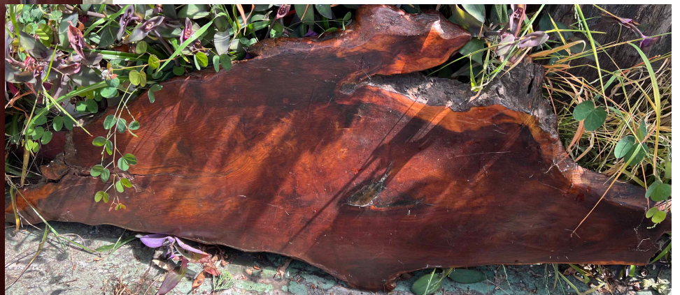
A few display stands and a large slab.