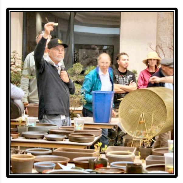
Daily Benefit Drawing & Live Auction

Fundraiser for THE GOLDEN STATE BONSAI FEDERATION COLLECTION AT THE HUNTINGTON February 23-24, 2019