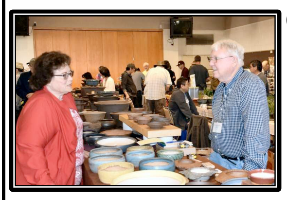
Select Vendors Selling Top-Quality Tools, Pots and Trees

GSBF Early Bird Passes For Bonsai Club Members 7:30am - 5:00pm General Public 10:00am - 5:00pm