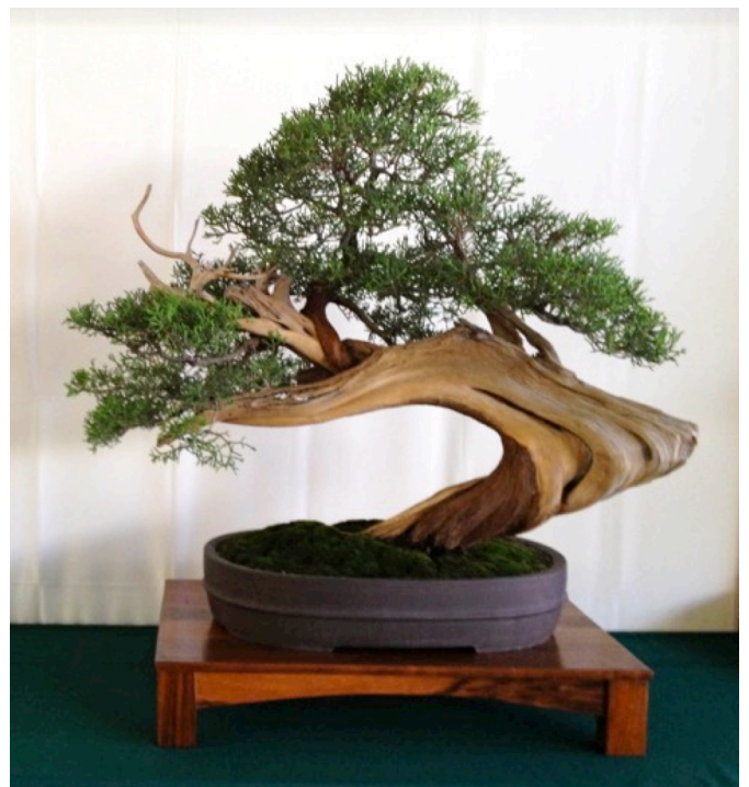
Photo right: Takuo Nakamura's tree from the 2013 show at the Bowers.